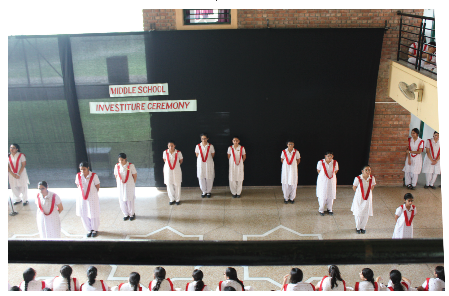
ISSUE X | VOLUME VII