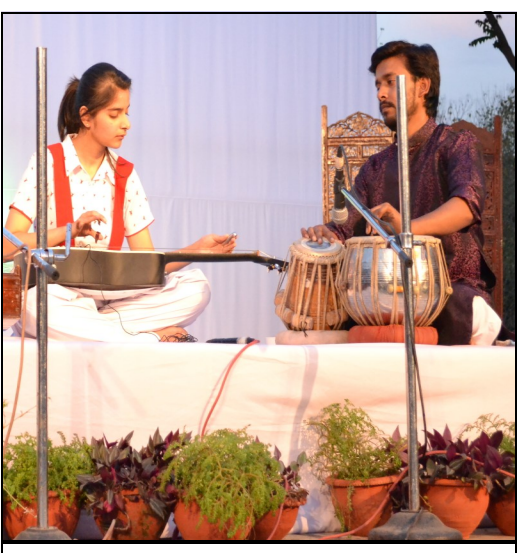
"Music expresses that which cannot be said and on which it is impossible to be silent."

The event started with the Tabla performance where students played difficult Lay as . Next was the stringed-instruments performance where girls played various instruments like Sitar , Santoor and the Indian Guitar . The compositions were based on different Raags which the young musicians brought out well. Up ahead, we heard the melodious young singers perform a vocal duet starting with Bandish followed by a series of Taans and Taranas . The Western choirs came in next, singing famous songs composed by Abba and Boney M. This was also a tribute to these legendary pop