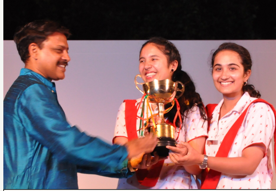
"Winning is not everything, but the effort to win is."